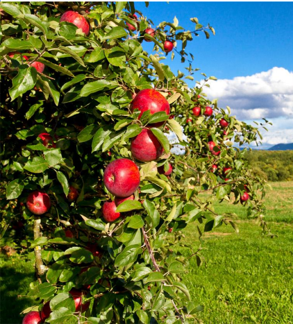
Organic Plant Protection